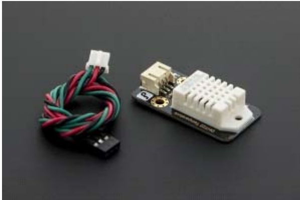
DHT22 Temperature and humidity module SKU:SEN0137