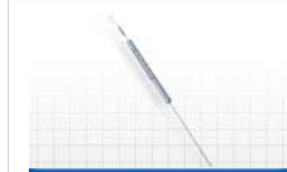
Push-Pull Precision Force