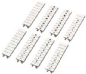
Zack marker strip, 10-section, horizontally labeled with the identical number: 2, white, width: 5 mm

Please be informed that the data shown in this PDF Document is generated from our Online Catalog. Please find the complete data in the user's documentation. Our General Terms of Use for Downloads are valid ( http://phoenixcontact.com/download )